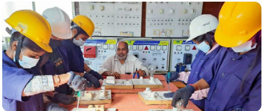
A skill development training session at one of our factory sites

Government Schemes Facilitated in FY 2023-24 through WFCs and CFC